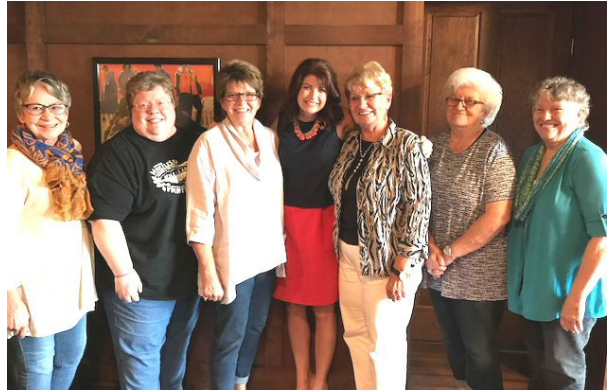
Lt. Governor Rebecca Kleefisch along with our wonderful volunteers!

When you find it hard to turn against traffic onto highway 2.... that means it is tourism season! People from all over the country have purposely spent money and vacation time, to include or make Ashland their destination. That is pretty special. It warms my heart when I am in the grocery store and I see families, with both young and older children, shopping. You can always tell when they are on vacation!!