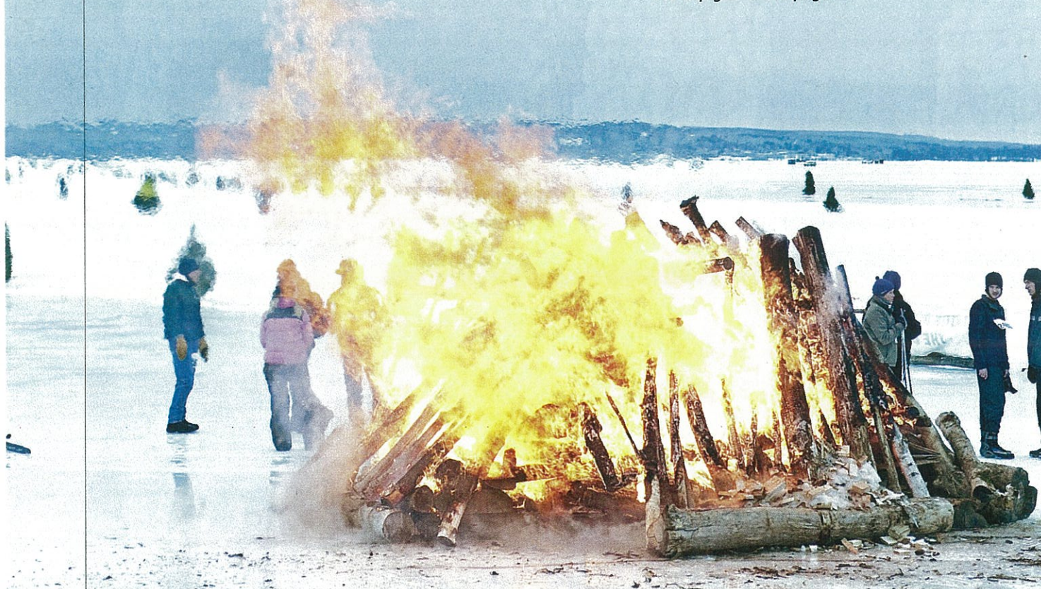
• The bonfire will spark again February 18 for Book Across the Bay in Ashland, Wisconsin. (Above right) Luminarias brighten the frigid route.